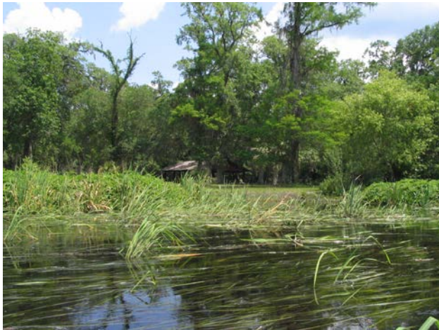
Goose Pasture Campground, FWC

Plan on camping several days at the Goose Pasture Group Campground on the Wacissa River to explore this exceptionally scenic area. There is a group camp adjacent to the public campground with portable toilets, grills and covered pavilion. Neither campground charges any fees and both are closed during general gun season. Call the Suwannee River Water Management District to make reservations and get the gate code to the group camp (386) 362-1001.