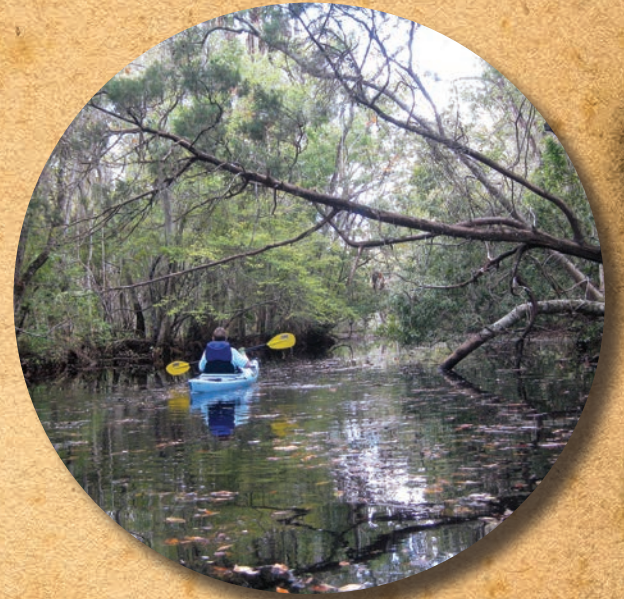
An early autumn paddle on Sandfly Creek.