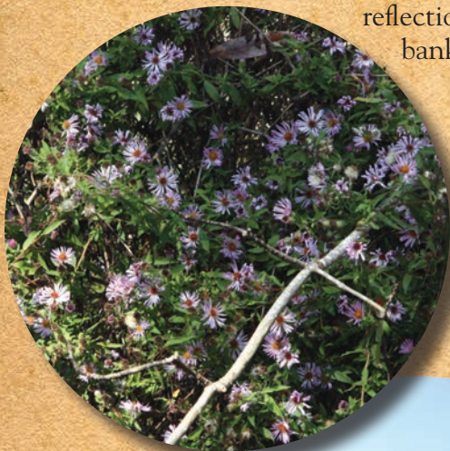
Clumps of lavender flowers line the creek. These are probably Elliott's Asters.

One of the most pleasing spots on the Lower Suwannee National Wildlife Refuge, the isolated Sandfly Creek is a serene, supremely beautiful, and easily navigated waterway. While impressive, its forest cover is probably a pale reflection of the original vegetation (see Spyglass below). Flowering plants visited by butterflies line the banks. Alligators, turtles, river otters, and red-shouldered hawks may be seen.