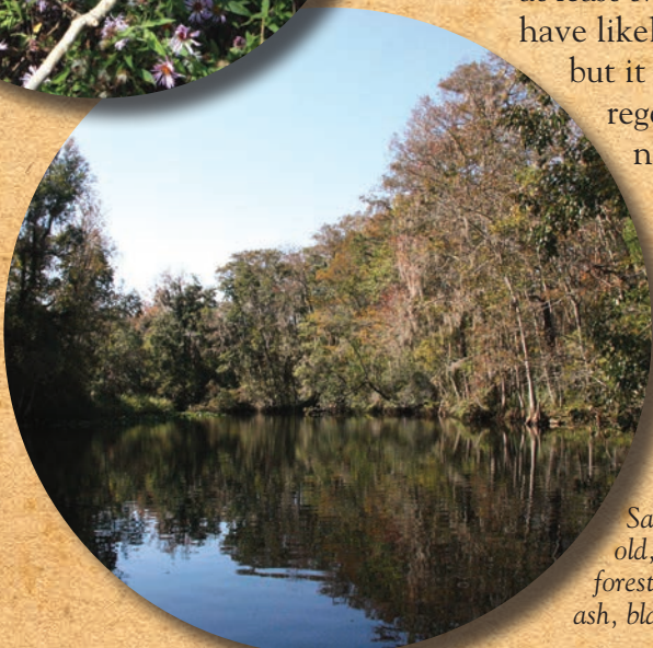
Sandfly creek is well forested, but the forests are certainly less than 100 years old, lacking the giant cypresses and hardwoods that originally comprised the swamp forest. Dominant trees now include cypresses, swamp bay, one or more species of ash, black gum, tupelo, and others.

What may at first strike paddlers as a wild and unspoiled swamp forest has been cut over at least twice—first to harvest ancient cypresses, and later hardwoods. Upland forests have likely been logged even more frequently. Cutover swamps will regenerate naturally, but it may take decades before they again appear forest-like, and much longer to regenerate the giant cypresses that once dominated. On the adjacent uplands, natural regeneration requires periodic fires. Longleaf pine, a fire-adapted species now all but absent from the refuge was cut over early. Wildfires were suppressed, and the uplands regenerated to hardwoods. The present regime of controlled burning favors another species, slash pine, but refuge managers are attempting to restore stands of the original longleaf pine in selected areas.