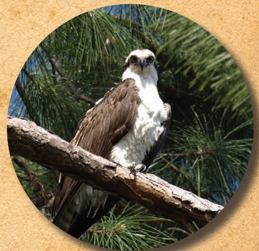
Ospreys roost in the forested uplands above coastal marshes and prey on fishes and other small animals in brackish creeks.