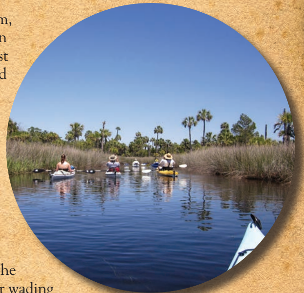
On Shired Creek, approaching the Dixie Mainline bridge.

Continuing upstream, the marshes are less extensive, and tree-covered uplands begin to close in on the creek. Freshwater marsh plants become more prominent. However, higher-than-normal tides and storm surges may bring sea water this far inland. Salt water pushed landward of the bridge may be restricted in its return flow by the road, and can remain on the land longer than it would have under primeval conditions. Animals and plants characteristic of both the uplands and the coastal marshes can coexist here when conditions are favorable. Alligators are common, as are freshwater fishes like smallmouth bass; both may venture into brackish waters to feed on abundant small fishes and invertebrates. Raccoons and river otters may forage here as well. Bald eagles and swallowtail kites may be seen overhead.