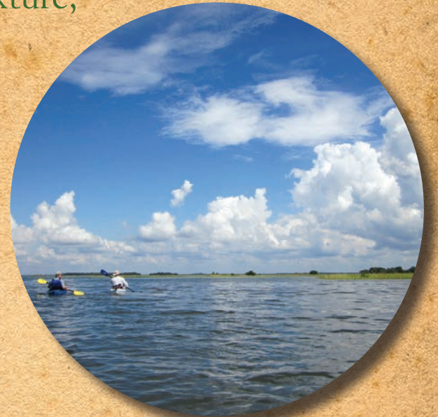
Rounding Buck Island

Consisting of a huge collection of prehistoric debris, Shell Mound is one of the highest geographic features on the Gulf Coast. From the boat launch one gets a good view of the marsh and its zonations, with so-called high marsh mostly covered by grayish-hued black needlerush, low marsh signified by greenish smooth cordgrass, mostly occurring on the edges of the marsh and in deeper spots, and patches of feathery saltmarsh hay on slightly higher elevations. To the west of the boat launch is Hog Island. Consisting of four tree-covered areas of high ground, its greatest area consists of periodically flooded marsh. The island also has prehistoric shell accumulations and its uplands were the sites of long-ago plundered Paleoindian burial grounds.